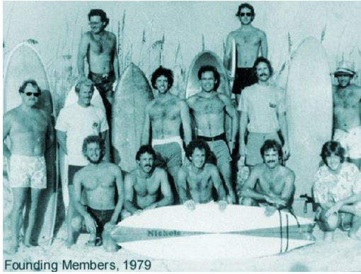
Founding Members, 1979